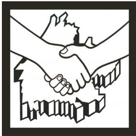
Parti Bersatu Sabah